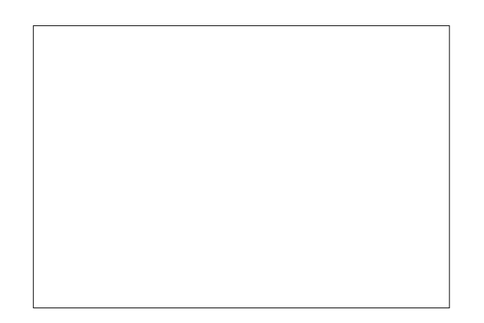
Figure 1. Example of caption. It is set in Roman so that mathematics (always set in Roman: B \sin A = A \sin B ) may be included without an ugly clash.

When citing a multi-author paper, you may save space by using "et alia", shortened to "et al." (not "et. al." as "et" is a complete word.) However, use it only when there are three or more authors. Thus, the following is correct: "Frobnication has been trendy lately. It was introduced by Alpher [3], and subsequently developed by Alpher and Fotheringham-Smythe [1], and Alpher et al. [2]."